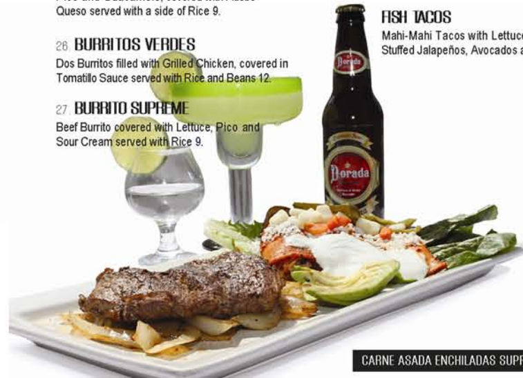
CARNE ASADA ENCHILADAS SUPREME

Beef Burrito covered with Lettuce, Pico and Sour Cream served with Rice 9.